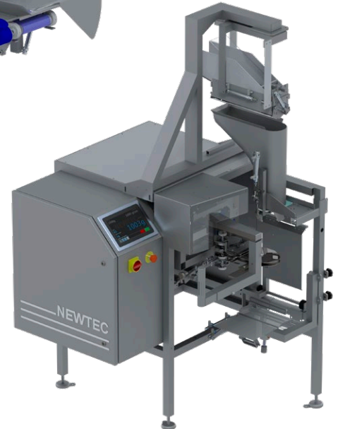
PEB41G for carrots Shaking collecting pan for alignment of carrots