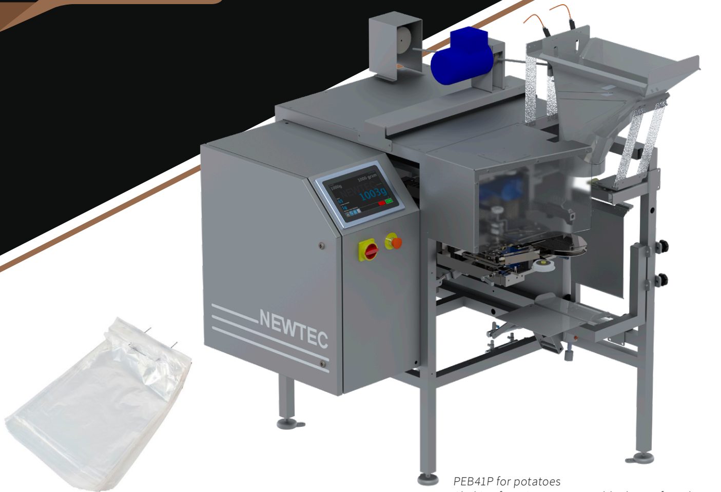
PEB41P for potatoes Shaking function to prevent blockage of products

CUSTOMISED ACCORDING TO PACKAGING TYPE AND PRODUCT