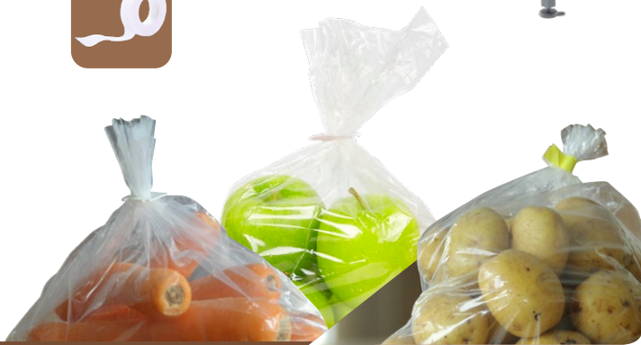
TOP TRIM OPTION