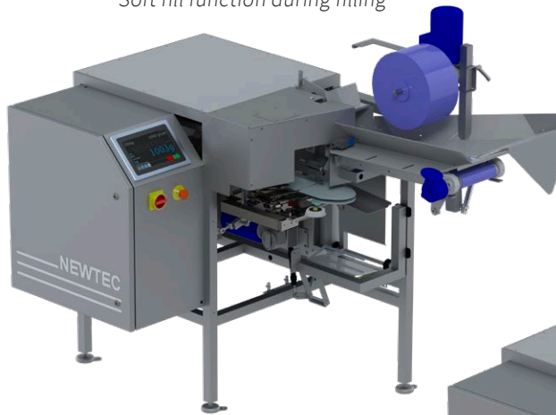
PEB41A for apples Soft fill function during filling